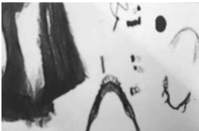
FIG. 2—First bag with jaws.

The last body bag was made up “body bag #3”; this contained all the items from Bags 1 and 2. This is to simulate a body bag with commingled remains, which might be found at a mass disaster site. All the options on the scanner were utilized and all pig and human dental objects and other foreign objects were quickly and easily identified (Fig. 3).