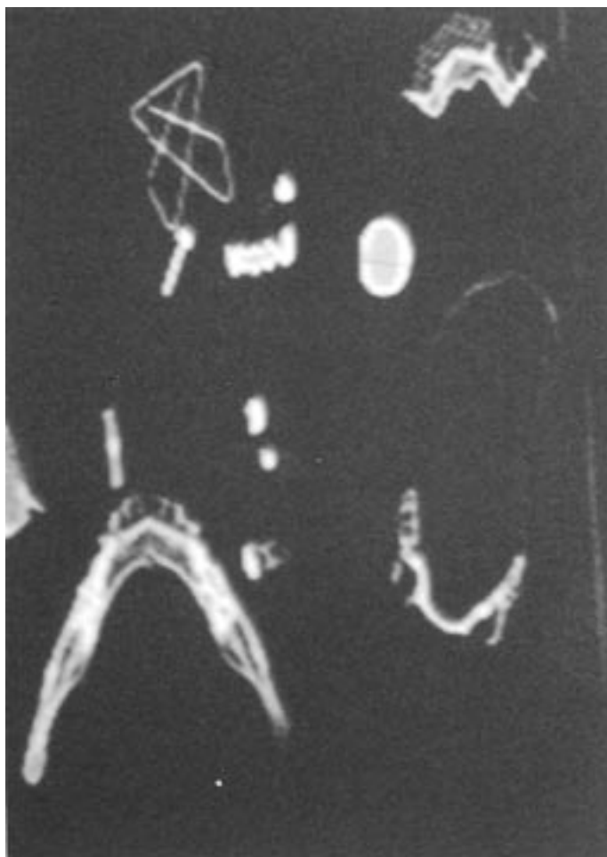
FIG. 1— Simulated bag.

A second body bag (#2) was prepared. Into this bag a human maxilla and mandible containing teeth with restorations, loose teeth both with and without restorations, an acrylic full denture, acrylic partial denture, a metal partial denture, a small plastic pencil sharpener in the shape of a toy gun, a small metal ball, 3/4 in. diameter, and a metal paper clip was placed into the Linescan unit. All items were easily distinguished.